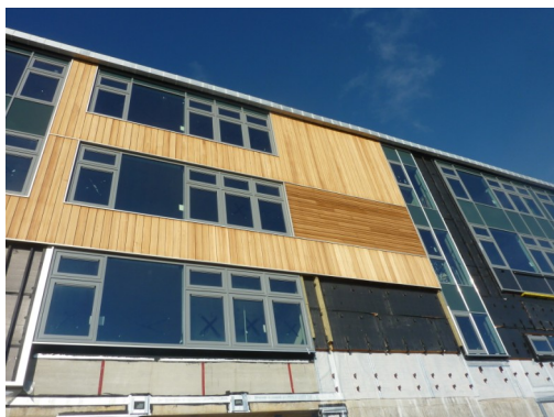
Cladding on South side of school