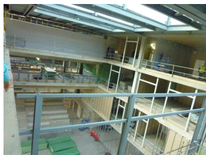
Looking down into the atrium