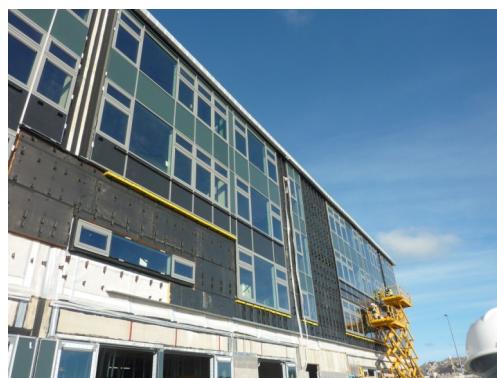
The join can be seen on the left

Opaque glass and windows going up on the outside frame, which is called a 'curtain wall'