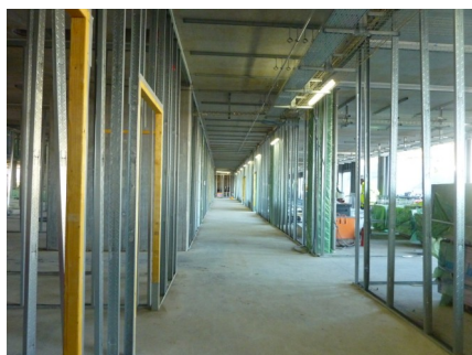
An unfinished corridor