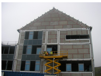
Windows going in

The outside of the school is looking good, with most of the glass in and the cladding starting to go up. The cladding is made of thermally modified Ayous hardwood which has been chosen to suit Shetland weather. We were very lucky to be able to go up onto the roof space where Mrs Reid would like to put a telescope. Landscaping is also well ahead and the car park is being marked out for car spaces.