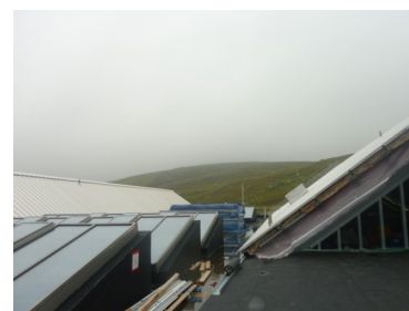
Up on the roof

The outside of the school is looking good, with most of the glass in and the cladding starting to go up. The cladding is made of thermally modified Ayous hardwood which has been chosen to suit Shetland weather. We were very lucky to be able to go up onto the roof space where Mrs Reid would like to put a telescope. Landscaping is also well ahead and the car park is being marked out for car spaces.