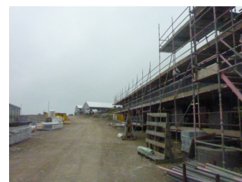
View back towards the school from the hostel

The hostel bedrooms are also partitioned off now and these are well designed rooms with a good use of space. There are lots of single rooms and a few twin rooms. The same wood will be used for cladding the school and the Hostel.