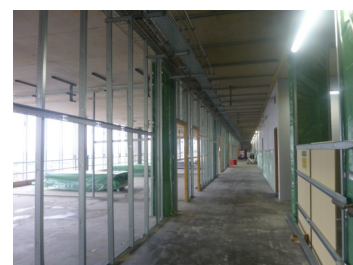
Looking down a corridor