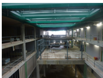
Looking towards library

Inside the school things are really beginning to take shape, with partition walls up on the south side of the school and classrooms now becoming obvious. It is hoped to have the entire school wind and watertight by October. We went inside some of the maths classrooms and they are huge! The glass roof is now in place and this allows lots of light into the library and atrium areas.