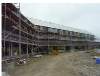
The hostel with windows going in

The hostel bedrooms are also partitioned off now and these are well designed rooms with a good use of space. There are lots of single rooms and a few twin rooms. The same wood will be used for cladding the school and the Hostel.