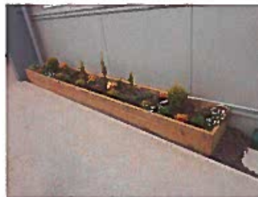
Flower boxes provided by COPE to brighten up the office block