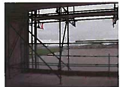
A window frame being installed