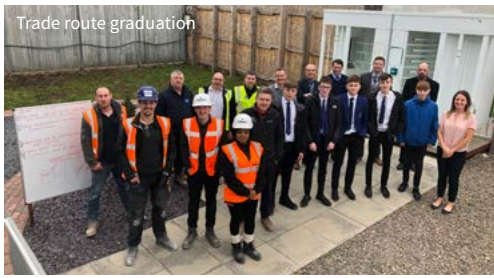
Trade route graduation