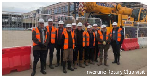
Inverurie Rotary Club visit

The Inverurie Rotary Club was one of the most recent groups to visit the site. The group received a presentation on the project progress to date followed by a site tour. Next on site will be the Inverurie Academy pupils involved in our Robertson Reporters programme.